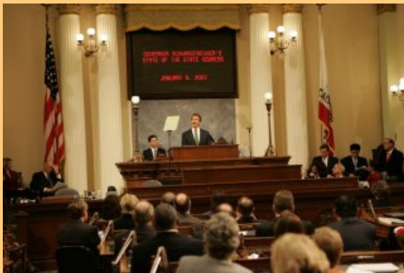
Governor Schwarzenegger delivering the State of the State Address in Sacramento.

As we prepare to go to press with this issue of Out & About , I am engaged in discussions at the local, county, and state level concerning Governor Schwarzenegger's proposed budget cuts. A reduction of 10% across the board appears to be an evenhanded way to deal with the anticipated shortfall in the year ahead. The concern, however, is that cuts for 2008-09 are a prelude for more cuts in 2009-10 and the future. We appear to be on the brink of a downward spiral that is gaining momentum and, as so often happens, those who are the most vulnerable are likely to suffer the most.